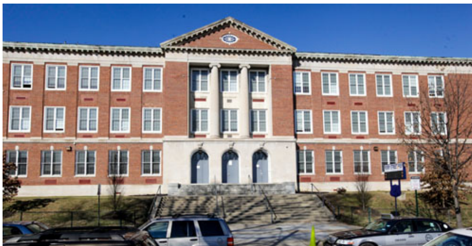
Photograph of 1800 Perry St. NE